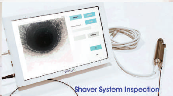
Shaver System Inspection