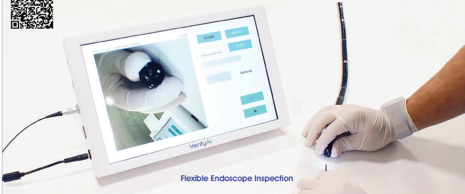
Flexible Endoscope Inspection