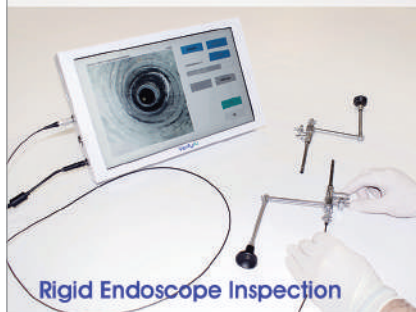
Rigid Endoscope Inspection