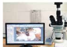
Training & Consulting