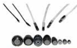
CCD & Electronics Repair