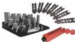
Tools & Devices