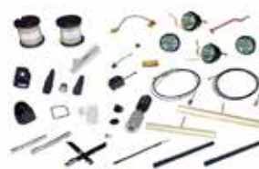
Endoscope Parts Flexible