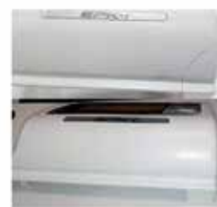
Processor Panel Repair