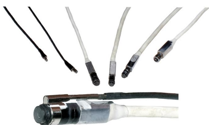
CCD' & Electronics Repair