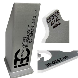
Laser Marking Services