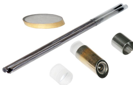
Endoscope Parts - Rigid