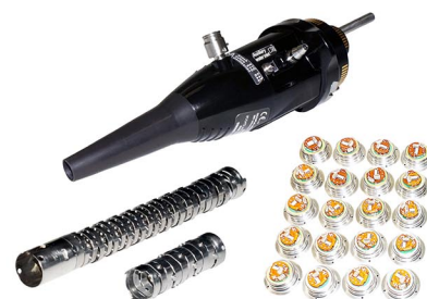
Endoscope Parts - Flexible