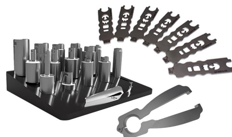
Tools & Devices