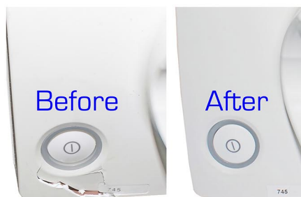
Processor Panel Repair